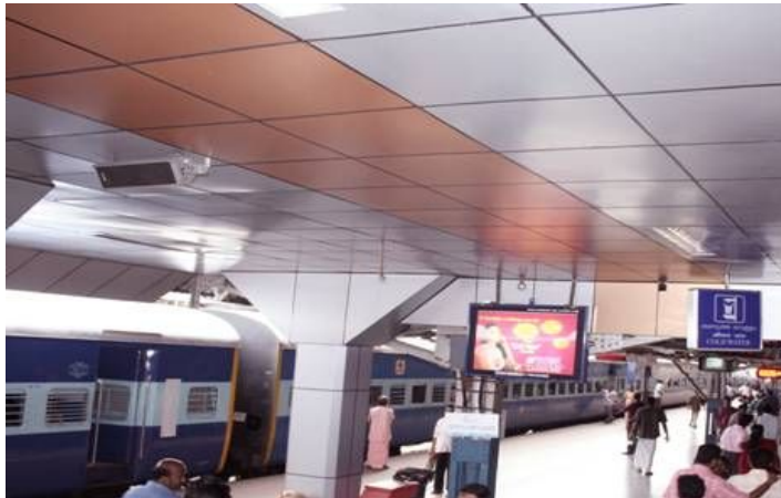
View of Platform No 1 at Trivandrum Central Station

Passenger Amenities: Trivandrum division has already provided minimum essential amenities as per laid down norms at all Railway stations in the division.