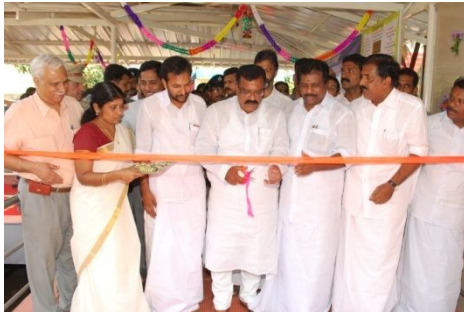
Hon Minister of State for Railways

Inauguration in connection with provision of Lift at Chengannur by