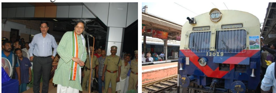
Inauguration of Duronthe Express & MEMU Services in the division has been one of the highlights of 2012-13.

To the discerned traveler, any mention of Kerala, conjures in his mind, an image of pristine backwaters, palm fringed beaches, tranquil villages and greenery in profusion. Nature has created an amazing bounty of diversities ranging from hills and valleys, forests, lakes, rivers, backwaters, beaches and the sea along an elongated coastline. So, it seems quite natural when Kerala is referred to, as God's own country. The division's railway network has been a dedicated and efficient carrier of travelers and tourists to the various destinations falling within its range.