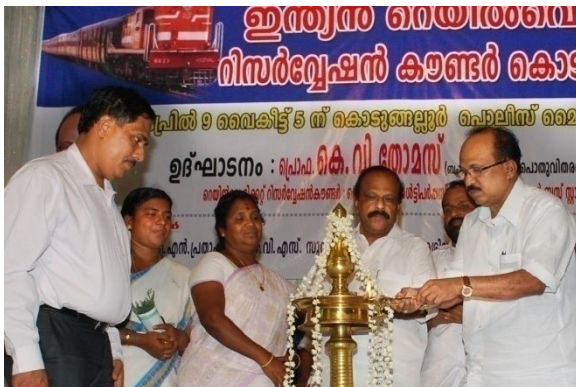
Hon. Union Minister for Food & Civil Supplies Shri.K.V.Thomas inaugurating non-rail head PRS at Kodungalloor

Computerized Passenger Reservation System is functioning at 65 locations in the division, which includes a large number of non-rail head locations.