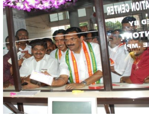
Inauguration of Non-rail head PRS at Attingal and Kanjirapally

Major strides have been made in opening of PRS locations at Non-Rail head locations under 1000 PRS Scheme utilizing personnel arranged by the State Government departments. Trivandrum division is a fore-runner in commissioning of PRS locations under this scheme.