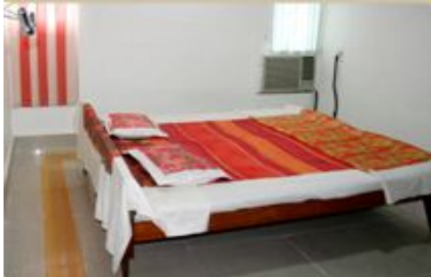
AC Retiring Room

Taking into consideration the requirements of lady passengers travelling alone to the capital city, exclusive dormitory and AC huts have been earmarked for ladies at Trivandrum Central, the first of its kind on this Railway.