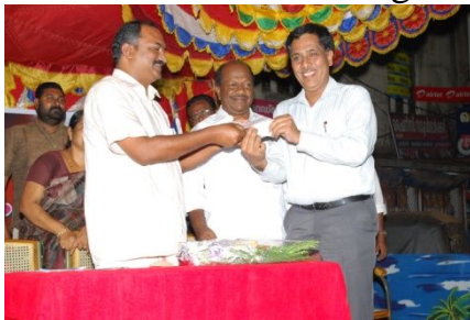
Inauguration of NRH/PRS at Ayur

Major strides have been made in opening of PRS locations at Non-Rail head locations under 1000 PRS Scheme utilizing personnel arranged by the State Government departments. Trivandrum division is a fore-runner in commissioning of PRS locations under this scheme.