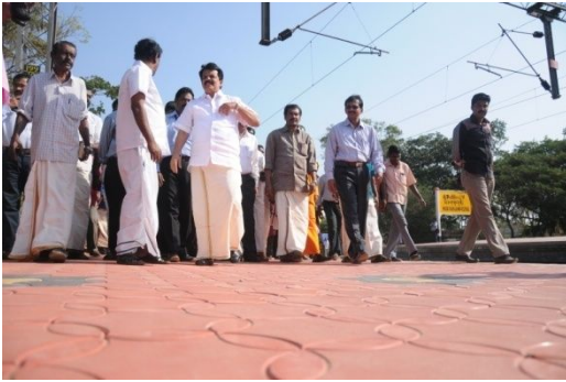
Inaugural function of Platform at Murukkampuzha, constructed with debris. First such enterprise in Indian Railways

Trivandrum Central, Ernakulam Jn Chengannur, Aluva, Nagercoil and Alapuzha.