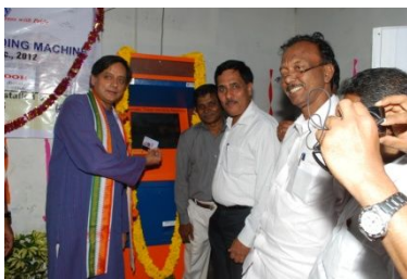
Inauguration of ATVM facility at Trivandrum Central Station by Dr Sashi Tharoor, Hon MOS/HRD.

Besides JTBS, Railways have also introduced Automatic Ticket Vending Machines recently for ease of purchase of unreserved tickets at select Railway stations. In Thiruvananthapuram division, ATVMs were introduced at five major stations in the division viz. Trivandrum Central, Kottayam, Ernakulam Jn, Aluva and Thrissur.